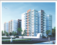
Nilgiri Heights Pocharam, Hyderabad 256 flats on 2.5 acres